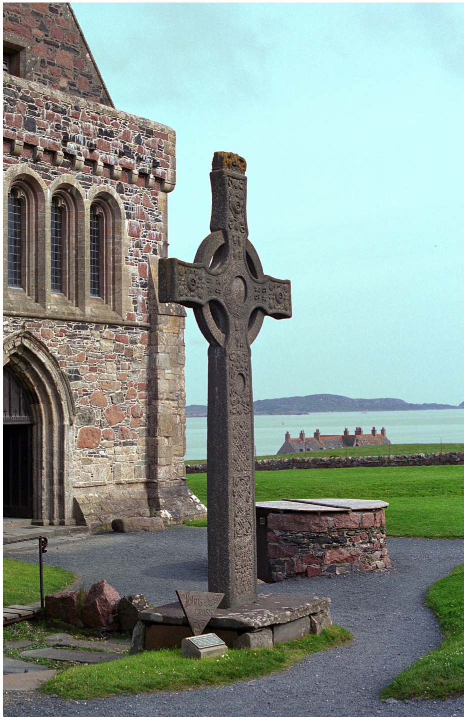
St. John's cross near the Iona Abbey on the Isle of Iona, Scotland.