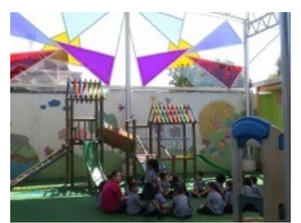
Hogar Escuela Barriacuba